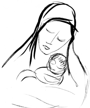
Drawing by Thomas Merton. Used with permission of the Merton Legacy Trust and the Thomas Merton Center at Bellarmine University.

Mother Seton House PO Box 673 Fryeburg, ME 04037